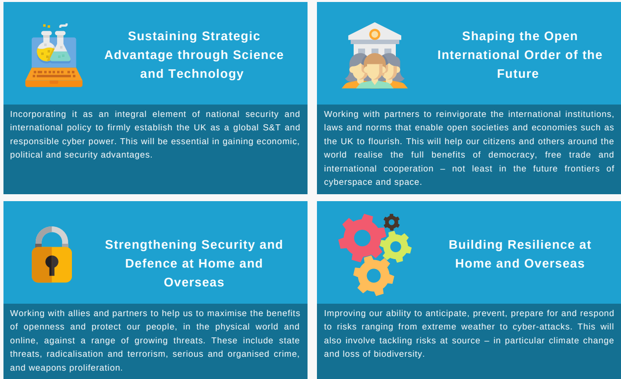
Figure 2: Four objectives proposed by the Integrated Review of Security, Defence, Development and Foreign Policy 3

Following the UK's decision to leave the European Union, the country is at a crossroads in regard to its place in the world. The recent Integrated Security, Defence, Development and Foreign Policy Review set out four objectives that the Government will seek to meet by 2025 3 :