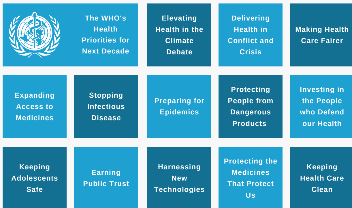
Figure 1: WHO list of top health priorities for next decade 2

Shortly after this list was published, COVID-19 broke out and the pandemic has dominated life around the globe ever since.